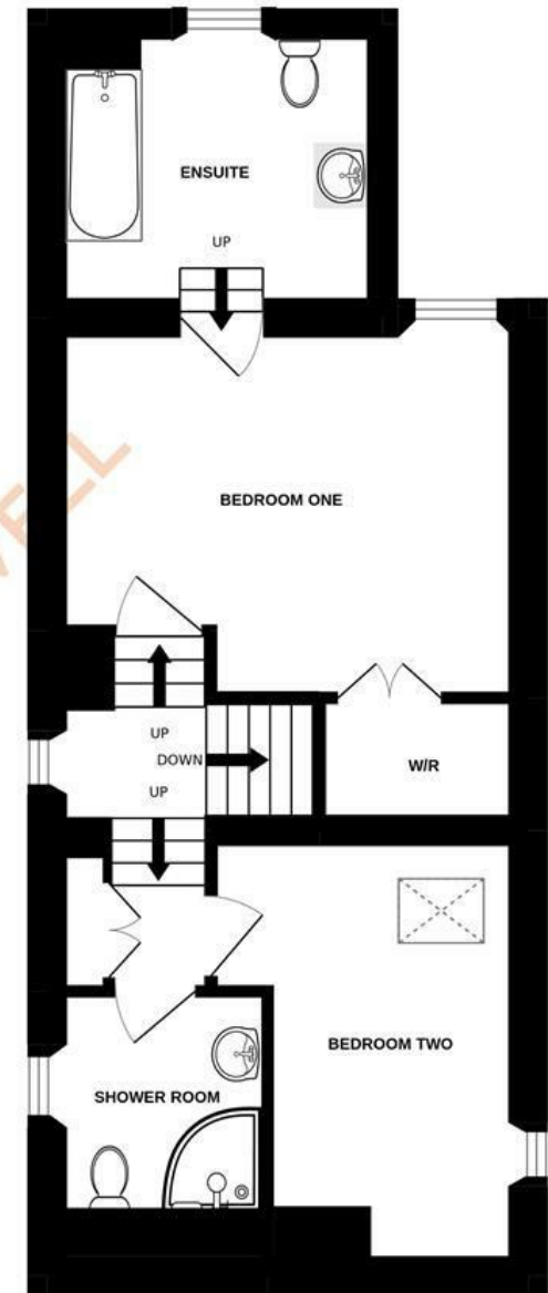
TOTAL FLOOR AREA : 1047 sq.ft. (97.3 sq.m.) approx.

Whilst every attempt has been made to ensure the accuracy of the floorplan contained here, measurements of doors, windows, rooms and any other items are approximate and no responsibility is taken for any error, omission or mis-statement. This plan is for illustrative purposes only and should be used as such by any prospective purchaser. The services, systems and appliances shown have not been tested and no guarantee as to their operability or efficiency can be given. Made with Metropix ©2022